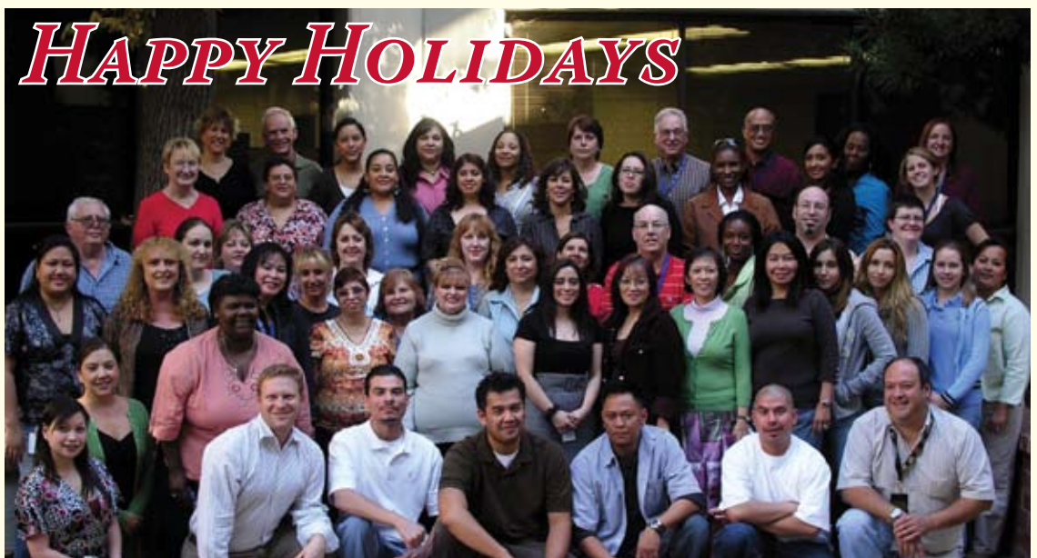
FROM THE EMPLOYEES OF ACCREDITED'S CORPORATE OFFICE WOODLAND HILLS, CALIFORNIA